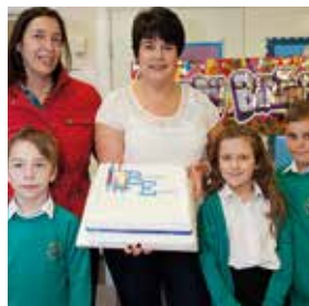
Brough Eagles Out of School Club celebrated its 10th Birthday with a magnificent fireworks display and a lovely birthday cake.